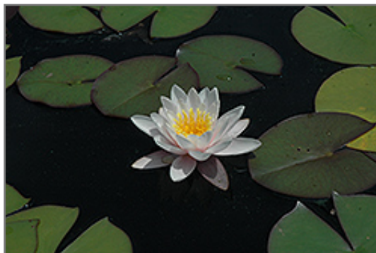
Colossea Hardy Water Lily flowers