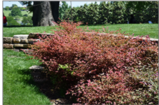
Flirt Nandina