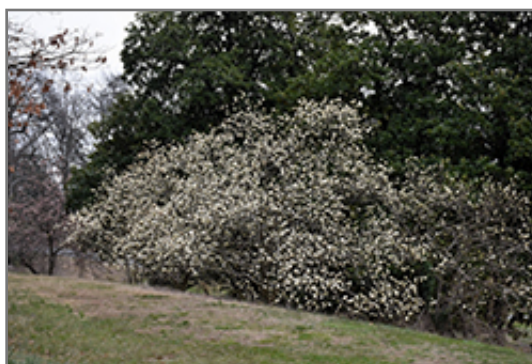
Norman Gould Magnolia in bloom