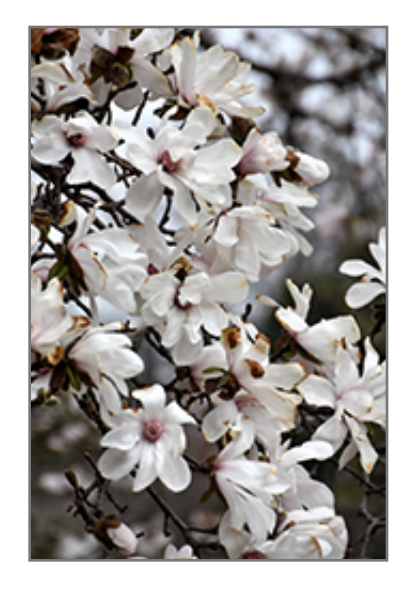
Merrill Magnolia flowers

This plant is not reliably hardy in our region, and certain restrictions may apply; contact the store for more information.