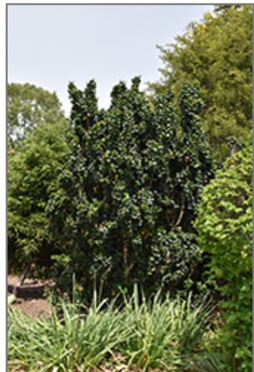
Dwarf Japanese Privet