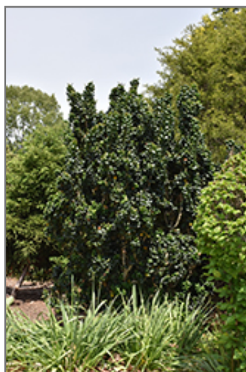
Dwarf Japanese Privet