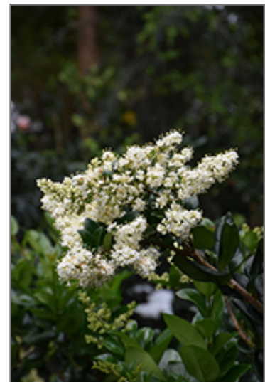
Japanese Privet flowers