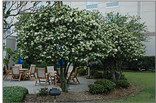
Japanese Privet in bloom