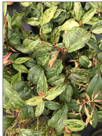
Rainbow Fetterbush foliage

Rainbow Fetterbush is recommended for the following landscape applications;