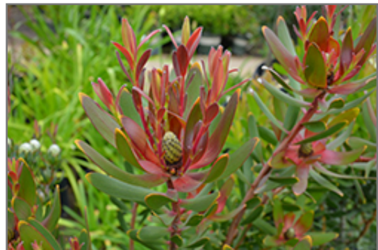
Safari Sunset Conebush flowers