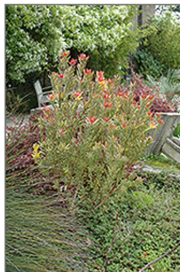
Safari Sunset Conebush

This plant is not reliably hardy in our region, and certain restrictions may apply; contact the store for more information.