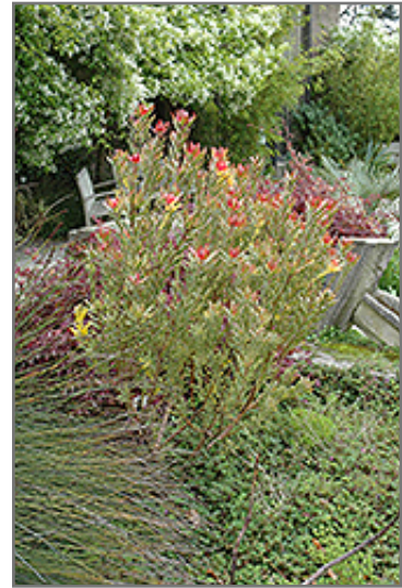
Safari Sunset Conebush

This plant is not reliably hardy in our region, and certain restrictions may apply; contact the store for more information.