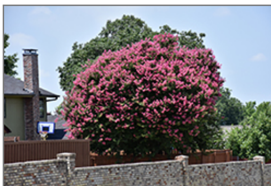
Zuni Crapemyrtle in bloom