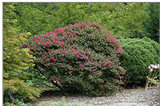
Pocomoke Crapemyrtle in bloom