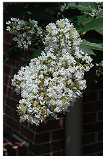
Natchez Crapemyrtle flowers

Natchez Crapemyrtle is recommended for the following landscape applications;