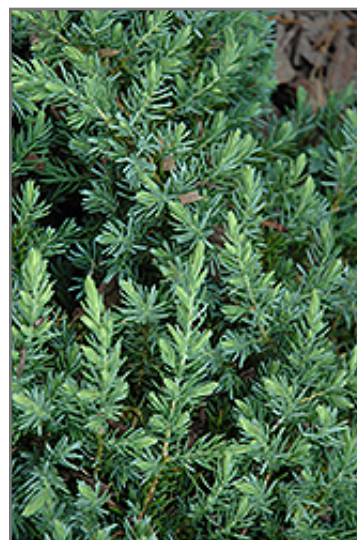
Blue Pacific Shore Juniper foliage