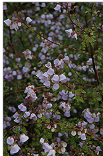
Violet Jovellana flowers

Violet Jovellana will grow to be about 4 feet tall at maturity, with a spread of 4 feet. It tends to fill out right to the ground and therefore doesn't necessarily require facer plants in front. It grows at a medium rate, and under ideal conditions can be expected to live for approximately 20 years.