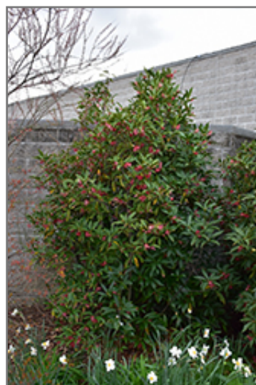
Woodland Ruby Anise Tree in bloom