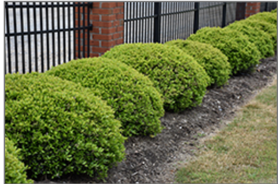
Dwarf Yaupon Holly

This plant is not reliably hardy in our region, and certain restrictions may apply; contact the store for more information.