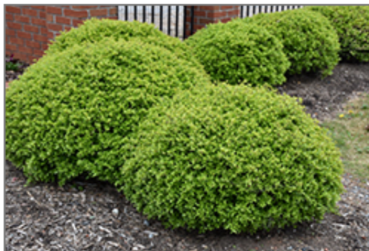
Dwarf Yaupon Holly