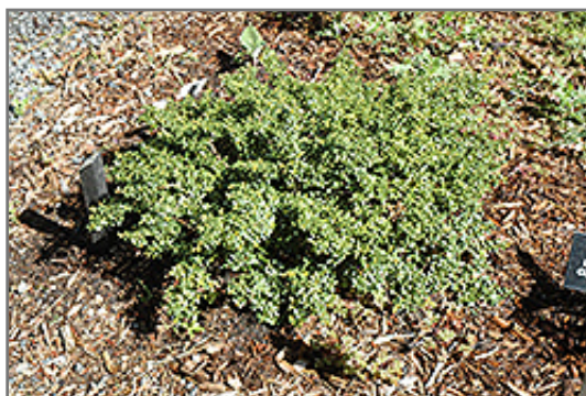
Lemon Gem Dwarf Japanese Holly