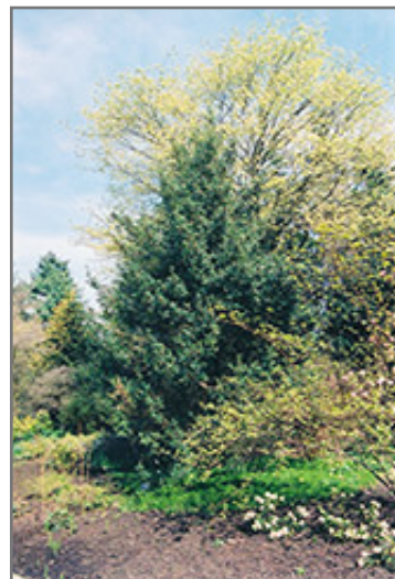
Pyramidal English Holly

Pyramidal English Holly will grow to be about 18 feet tall at maturity, with a spread of 10 feet. It has a low canopy with a typical clearance of 2 feet from the ground, and is suitable for planting under power lines. It grows at a fast rate, and under ideal conditions can be expected to live for 50 years or more.