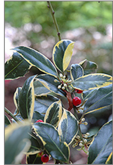
Aurifodina English Holly fruit