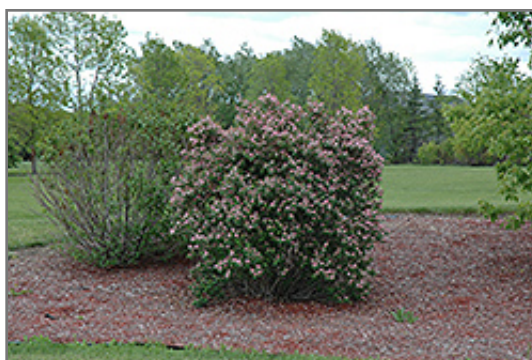
Honeyrose Honeysuckle in bloom