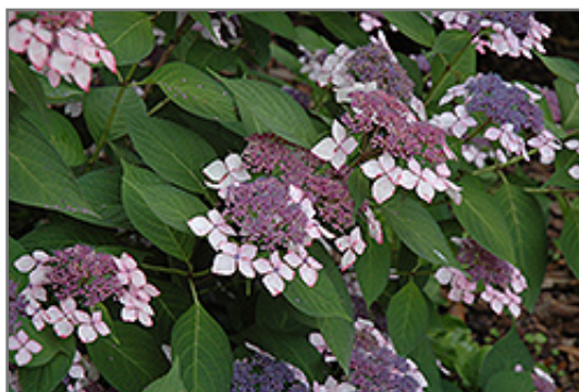
Grayswood Hydrangea flowers