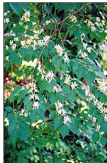
Morrow Honeysuckle flowers