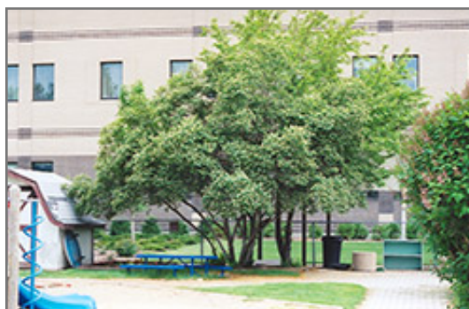
Morrow Honeysuckle in bloom