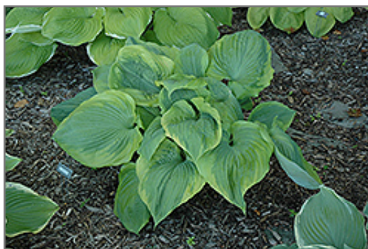
Sum Of All Hosta

Sum Of All Hosta is recommended for the following landscape applications;