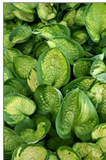
Rainforest Sunrise Hosta foliage

Rainforest Sunrise Hosta is recommended for the following landscape applications;