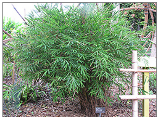
Blue Stemmed Bamboo