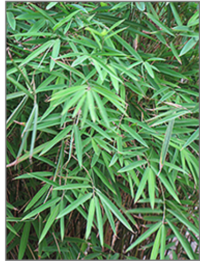
Blue Stemmed Bamboo foliage

This plant is not reliably hardy in our region, and certain restrictions may apply; contact the store for more information.