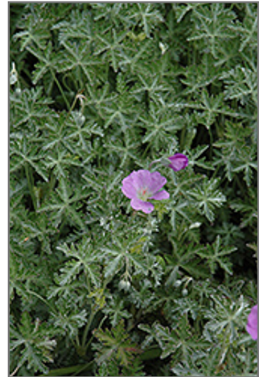
Silver Geranium flowers