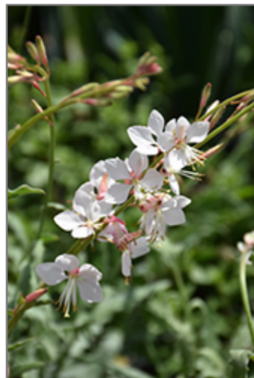
Whirling Butterflies Gaura flowers

This is a relatively low maintenance plant, and is best cleaned up in early spring before it resumes active growth for the season. It is a good choice for attracting butterflies to your yard, but is not particularly attractive to deer who tend to leave it alone in favor of tastier treats. It has no significant negative characteristics.