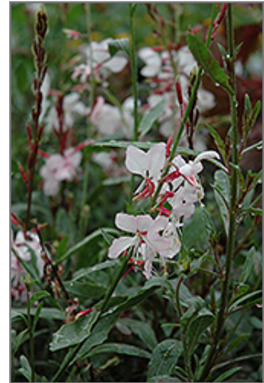
Ballerina Blush Gaura flowers

Ballerina Blush Gaura is recommended for the following landscape applications;