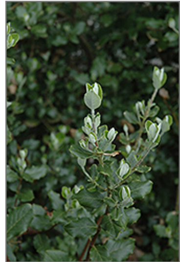
James Roof Silk Tassel Bush foliage