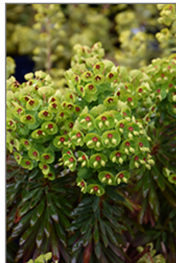
Tiny Tim Spurge flowers