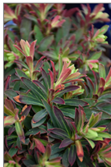
Tiny Tim Spurge flowers