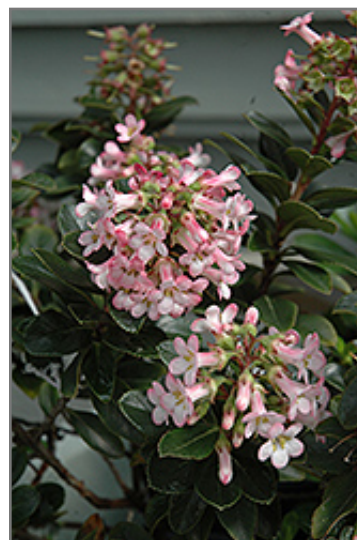
Pink Princess Escallonia flowers