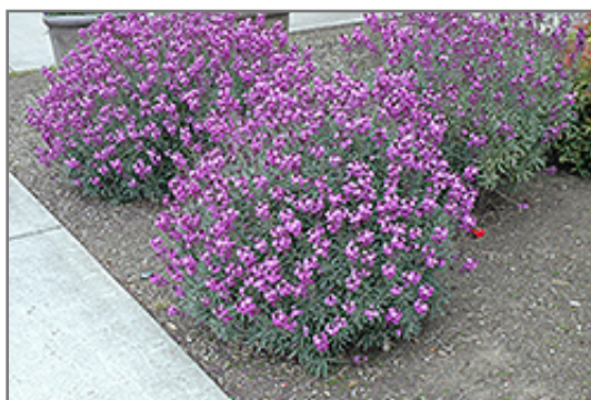
Bowles Mauve Wallflower in bloom