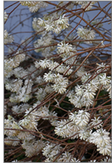
Oriental Paper Bush flowers

Oriental Paper Bush is recommended for the following landscape applications;