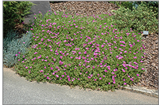
Purple Ice Plant in bloom

Purple Ice Plant will grow to be only 2 inches tall at maturity extending to 3 inches tall with the flowers, with a spread of 24 inches. Its foliage tends to remain low and dense right to the ground. It grows at a fast rate, and under ideal conditions can be expected to live for approximately 5 years. As an evergreen perennial, this plant will typically keep its form and foliage year-round.