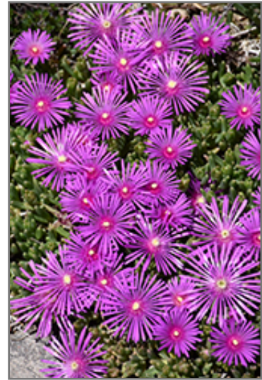
Purple Ice Plant flowers

Purple Ice Plant is recommended for the following landscape applications;