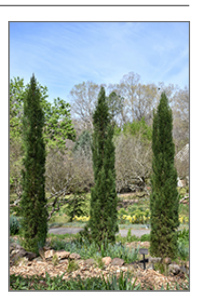
Blue Italian Cypress