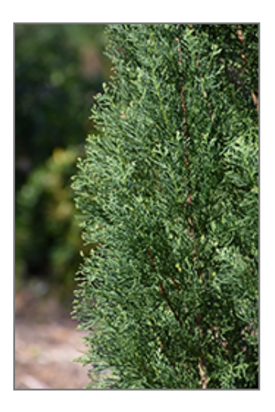
Blue Italian Cypress foliage