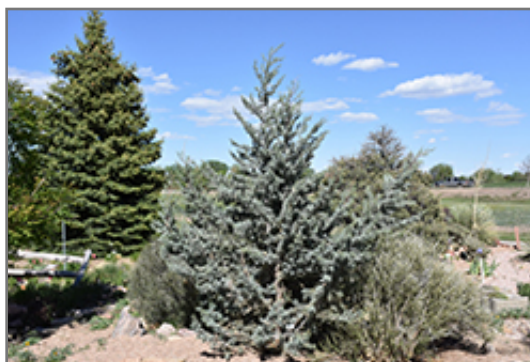
San Pedro Martir Cypress