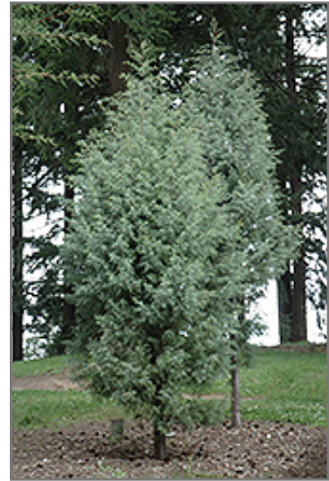
San Pedro Martir Cypress

This plant is not reliably hardy in our region, and certain restrictions may apply; contact the store for more information.