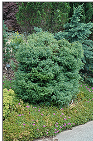
Mushroom Japanese Cedar