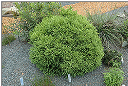
Little Diamond Japanese Cedar