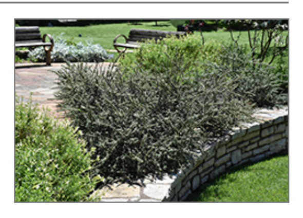
Gray Leaf Cotoneaster