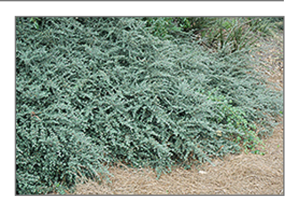
Gray Leaf Cotoneaster

Gray Leaf Cotoneaster will grow to be about 4 feet tall at maturity, with a spread of 6 feet. It tends to fill out right to the ground and therefore doesn't necessarily require facer plants in front. It grows at a fast rate, and under ideal conditions can be expected to live for approximately 30 years.