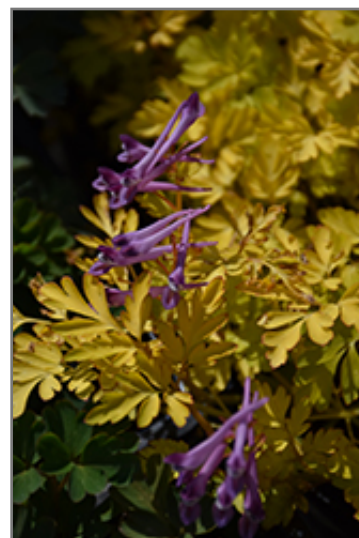
Berry Exciting Corydalis flowers