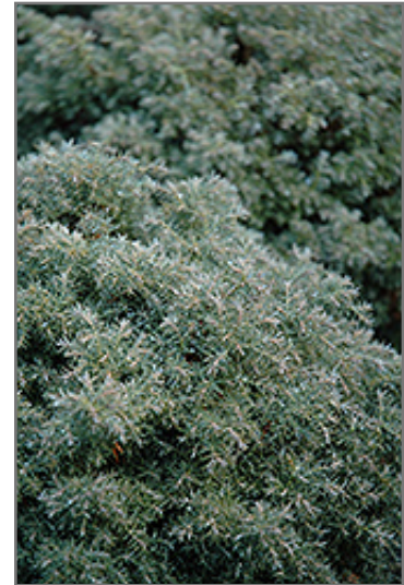
Cumulus Falsecypress foliage

Cumulus Falsecypress will grow to be about 3 feet tall at maturity, with a spread of 3 feet. It tends to fill out right to the ground and therefore doesn't necessarily require facer plants in front. It grows at a medium rate, and under ideal conditions can be expected to live for 70 years or more.