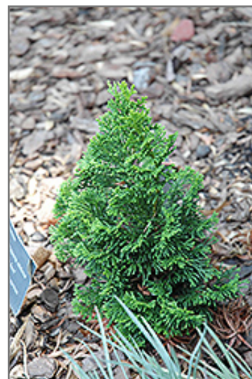
Little Ann Hinoki Falsecypress

Little Ann Hinoki Falsecypress will grow to be about 10 feet tall at maturity, with a spread of 8 feet. It has a low canopy with a typical clearance of 1 foot from the ground, and is suitable for planting under power lines. It grows at a slow rate, and under ideal conditions can be expected to live for 70 years or more.