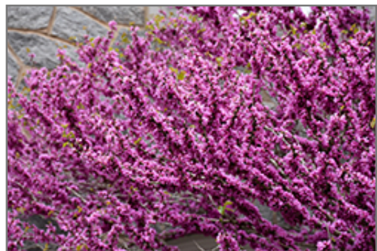
Don Egolf Miniature Redbud flowers