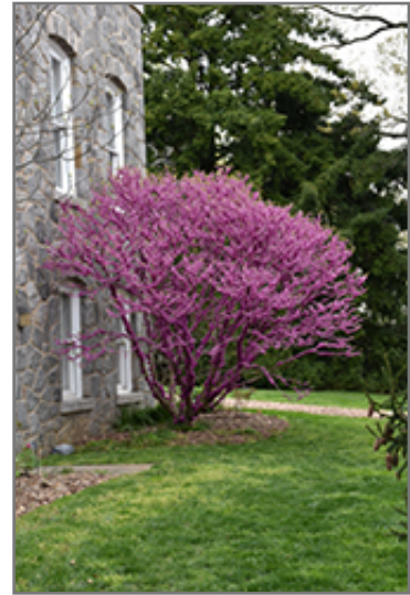
Don Egolf Miniature Redbud in bloom