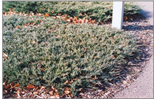
Webber Juniper

A high quality ground-hugging evergreen for use as a color accent groundcover, featuring bluish-green foliage all season long turning purplish in winter, wide spreading; extremely adaptable and hardy; ideal as a groundcover and for garden detail