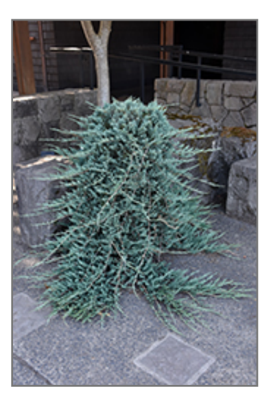
Blue Rug Juniper

Blue Rug Juniper is recommended for the following landscape applications;