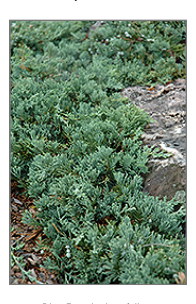
Blue Rug Juniper foliage