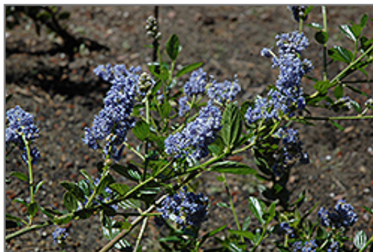
Santa Barbara California Lilac flowers