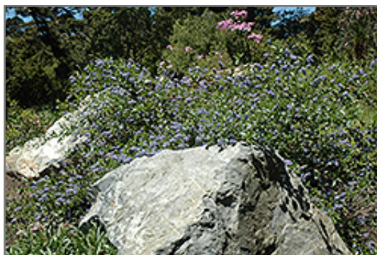
Santa Barbara California Lilac in bloom