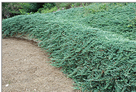
Bar Harbor Juniper