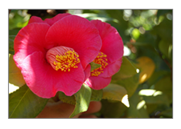
Japanese Camellia flowers

Japanese Camellia is recommended for the following landscape applications;