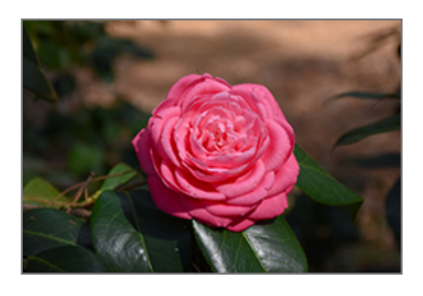
Japanese Camellia flowers