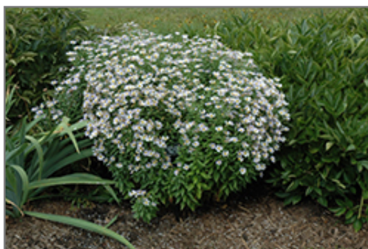
Jim Crockett Boltonia in bloom