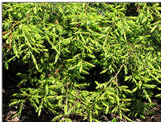
Depressa Aurea Juniper foliage