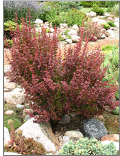
Orange Rocket Japanese Barberry

This plant is not reliably hardy in our region, and certain restrictions may apply; contact the store for more information.